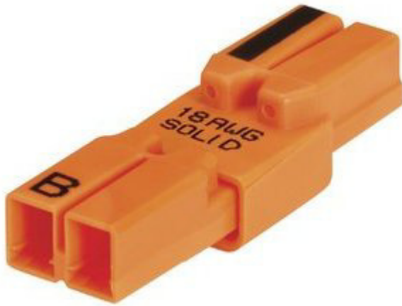
Ideal 30-082 connector